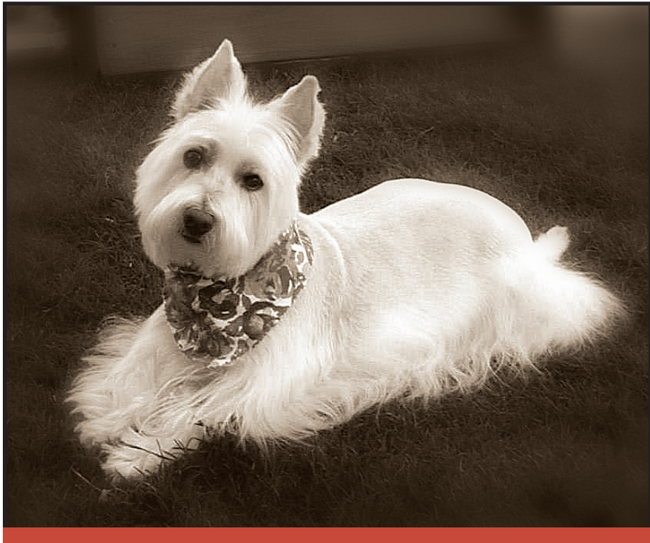
Acupuncture is a effective complement to conventional veterinary treatment. Practitioners frequently find that they can reduce the medication a dog receives if he also receives acupuncture treatments.

the acupuncture energy flow meridians of the endocrine glands, digestive organs, immune system, and kidneys.